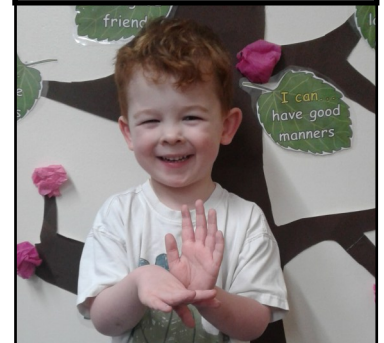
Stamp your Feet